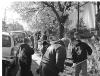
Ozone Park community volunteers clean the sidewalk around Bayside Cemetery and adjacent cemeteries during an Oct. 25 cleanup.